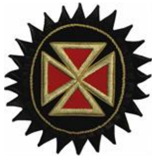
Specific Elected/Appointed Grand Officers