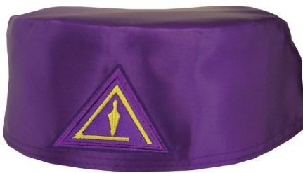
Members Soft Crown - (Pictured Above)

Members Hard Crown - (Pictured Above) will have the appropriate emblem centered on the front of the Crown. Remember, the break in the Triangle on all Crowns is on the observers Right side.