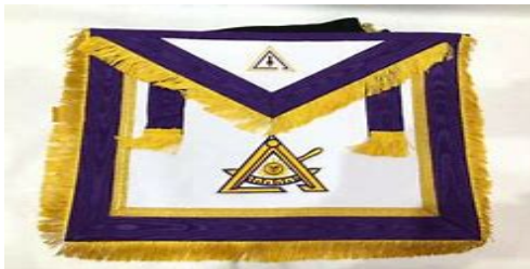
Example PTIM Aprons (pictured above)