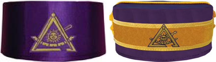
PTIM Crown - (Pictured Above)