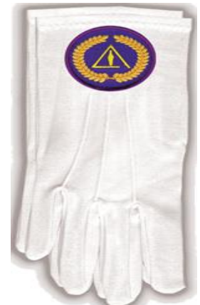
Grand Officers Gloves

This document has been updated to include a list of Supply Sources and items that are authorized to wear with the inclusion of the Convent General, U.S.A., PHA., INC for our Uniform requirements within the Jurisdiction of Oklahoma.