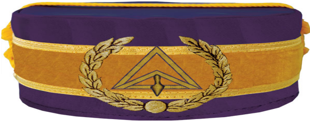
DDGTIM Crown - (Pictured Above)