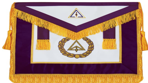
Example DDGTIM Apron (pictured above)