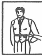
6 WAIST MEASUREMENT