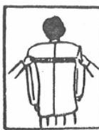
3 WITH OF BACK