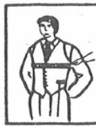
5. CHEST MEASUREMENT