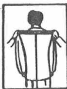
2 WIDTH OF SHOULDER