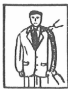
4 SLEEVE LENGTH