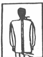
1 COAT LENGTH

All measurements to be written in inches in the box below each figure.