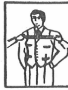
7 WIDTH OF CHEST